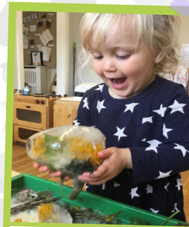
At Woodlands in Otters, some children have been exploring the wonder of a sunflower frozen in ice!