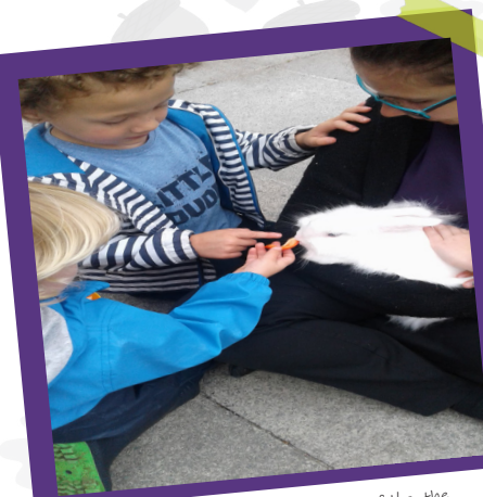
The children at Chester love taking care of Hop the rabbit, they have learned how to care, feed and clean out her home. Having her at the nursery has helped them learn empathy and created great bonds with her and the children.

We are also in the process of giving Broussa, Elmscot, Hale & Woodlands a Facebook page which is individual to them and will enable parents to see more of the activities happening at their setting.