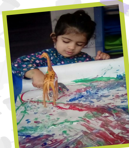
The Rainbow group at Happitots have been painting with vegetables and the jungle animals. We have been looking at the different interesting marks they can make.