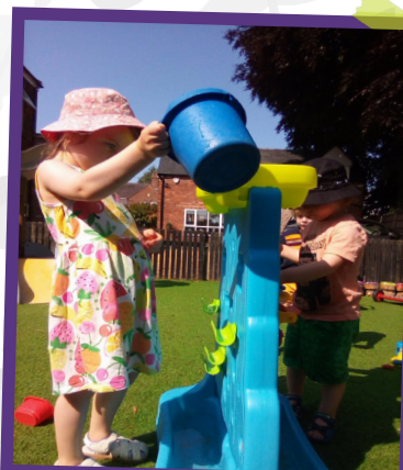
Poppies children have been enjoying water play in the sunny garden. They took it in turns to look at different ways of transporting the water from one area to the next.