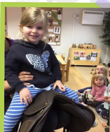
Over at Hale, the children had a chance to sit on a real saddle and pretend they were riding a horse. Hi-ho Silver!