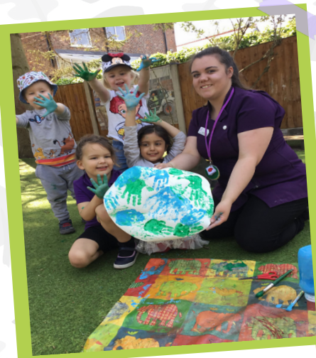
Elmscot children celebrated 'World Day' by making their own world in handprints!