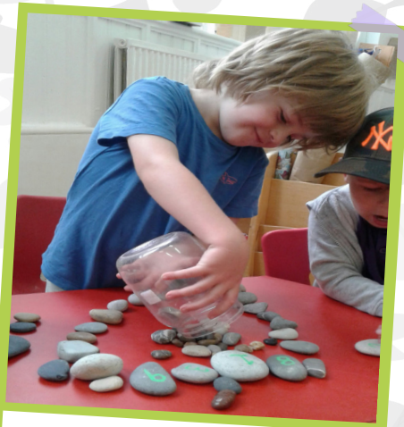
At Chester, Pandas have been doing a number recognition activity, choosing a stone with a number on and then matching up the correct quantity.