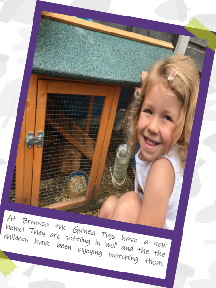
At Broussa the Guinea Pigs have a new home! They are settling in well and the children have been enjoying watching them.