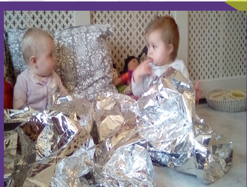
Look what fun the Sunshine room at Poppies had! The Children enjoyed a music and movement session exploring objects that made different sounds, throughout this session children communicated with each other by making sounds and facial gestures.