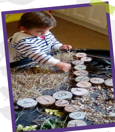
Happitots Sunshines have explored Dino world. Collecting lots of different items from the garden to make a nice home for the dinosaurs.