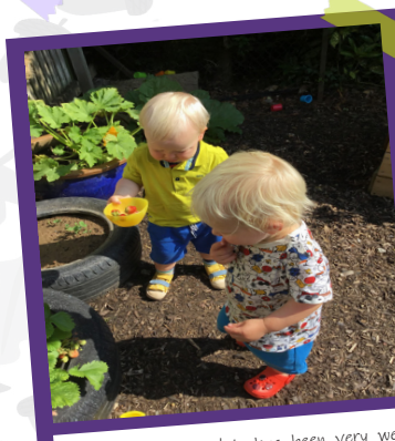
The allotment at Hale has been very well tended and the children enjoyed the fruits of their labour by having strawberries with their tea!