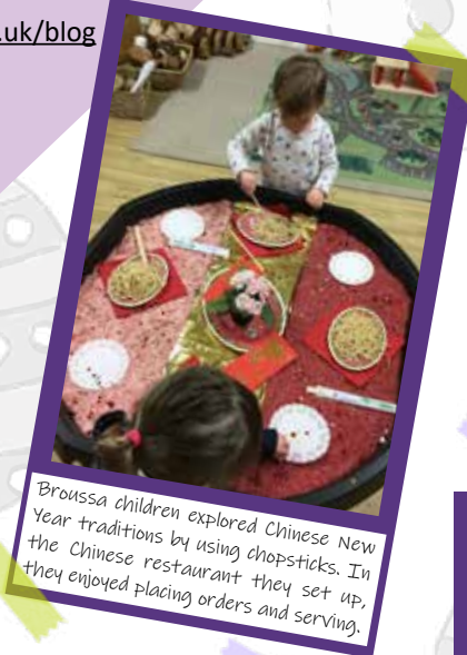
Broussa children explored Chinese New Year traditions by using chopsticks. In the Chinese restaurant they set up, they enjoyed placing orders and serving.