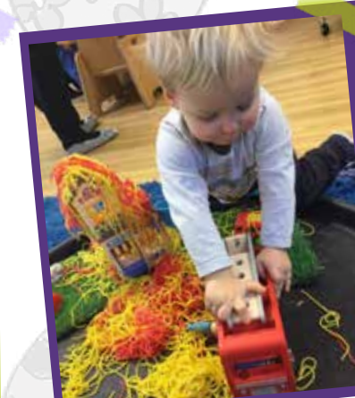
Children in Hedgehog room at Woodlands have been exploring the spaghetti to facilitate their interest in emergency vehicles.