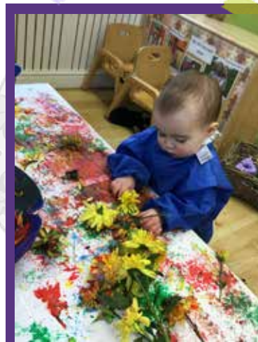
Children at Hale have been exploring flowers. They used them in new ways by making marks in paint.

Elmscot Hale raised a total of £79 for Save the Children during their Christmas Jumper Day!