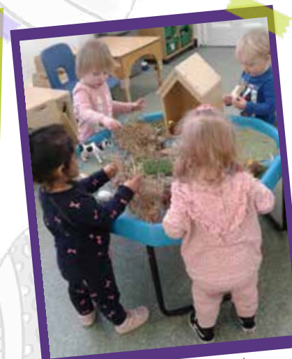
At Chester, Penguin children have been using sounds in play, looking at the farm animals and the noises they make.

Willow room at Elmscot Altrincham invited parents in for a creative morning. This gave parents a chance to interact and meet other parents, whilst having fun with their babies.