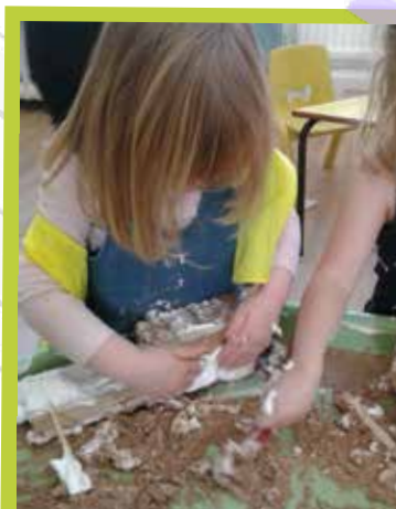
Pre-school at Chester used different materials to build walls, such as damp sand and shaving foam and looked at how many blocks they could stick together.