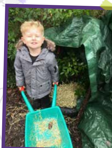
Oak room at Nantwich worked as a team to build animal shelters in the woodland area, talking about caring for wildlife in winter.