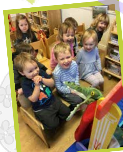
Badger room children at Hale set up their room to hold their own puppet show which was very funny!

Elmscot Woodlands children have been out and about on lots of trips in the local community. This included visits to the pet shop, post office and walks around the community looking at vehicle logos and creating tally charts. The children in Owls have been showing an interest in vehicles and were fortunate enough to welcome into nursery one of the children's Dads with his HGV truck and one of the children's Grandads with his tractor.