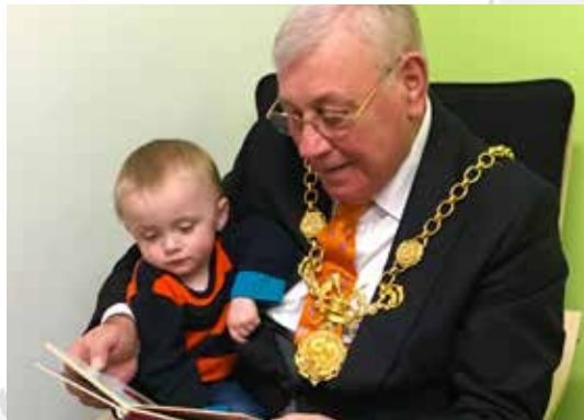
Lord Mayor of Chester enjoying a story with one of the Elmscot Chester children

The event saw the official reopening of Elmscot Group’s latest acquisition, formerly Little Friends Day Nursery in Chester.