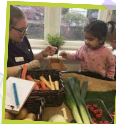
Badger room at Broussa set up a green grocers following a child's interests in shopping. They used real money, fruit and vegetables to shop with their friends.

Elmscot Hale raised a total of £79 for Save the Children during their Christmas Jumper Day!