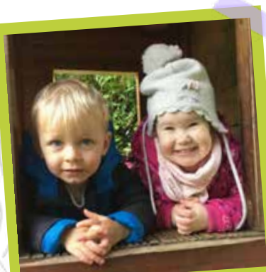
The children in Otters at Woodlands have been outside enjoying some den making activities.