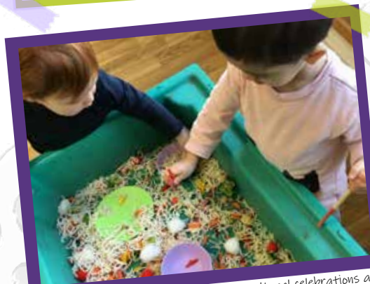
We've been discovering all about multicultural celebrations at Altrincham. Maple and Beech rooms have been celebrating Chinese New Year - playing with noodles and learning to use chopsticks.