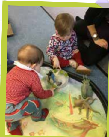
Willow room at Nantwich were very intrigued by the frozen sea animals! Sensory activities are loved by the babies and we love coming up with new ideas.