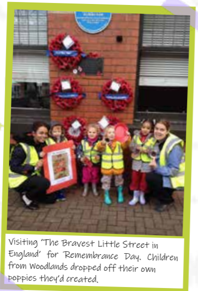
Visiting 'The Bravest Little Street in England' for Remembrance Day. Children from Woodlands dropped off their own poppies they'd created.