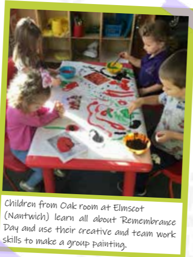
Children from Oak room at Elmscot (Nantwich) learn all about Remembrance Day and use their creative and team work skills to make a group painting.