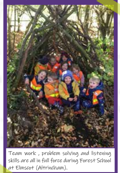
Team work, problem solving and listening skills are all in full force during Forest School at Elmscot (Altrincham).