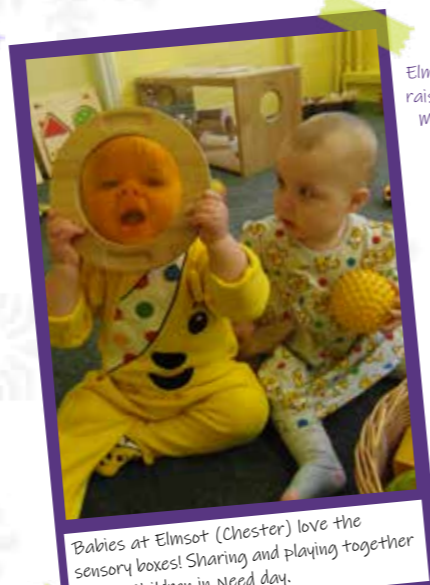
Babies at Elmscot (Chester) love the sensory boxes! Sharing and playing together during Children in Need day.