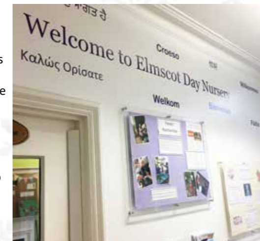
Parent partnership boards at Elmscot (Altrincham)