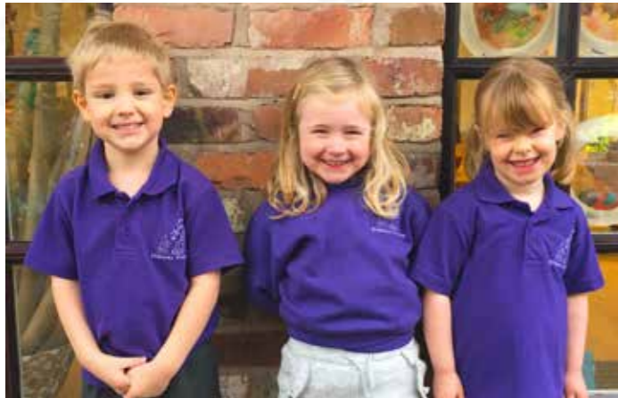
Above & below: Some of our Elmscot Group children wearing the polo shirt and sweaters

Following interest shown from parents, we're now offering the chance to purchase a branded polo shirt and sweatshirt. This is a not-for-profit service and we're also encouraging parents to dress children in comfortable clothes that are suitable for the weather. In pre-school we find that loose fitting jogging pants, leggings, shorts and skirts work well, to help children with getting changed and using the toilets independently.