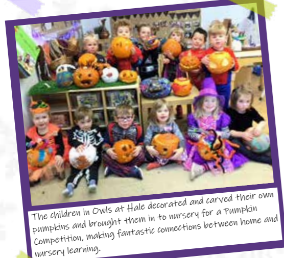
The children in Owls at Hale decorated and carved their own pumpkins and brought them in to nursery for a pumpkin Competition, making fantastic connections between home and nursery learning.