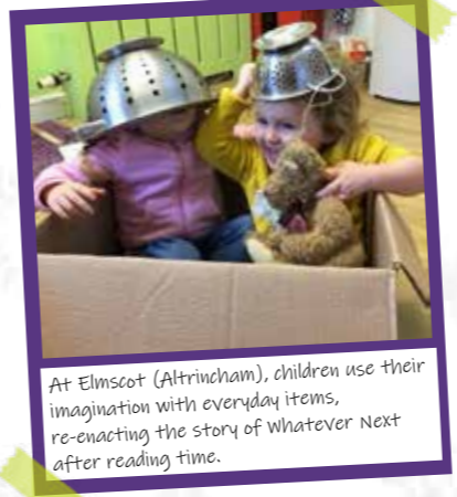
At Elmscot (Altrincham), children use their imagination with everyday items, re-enacting the story of Whatever Next after reading time.