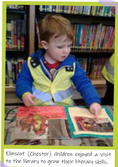
Elmscot (Chester) children enjoyed a visit to the library to grow their literacy skills.