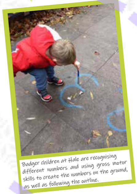
Badger children at Hale are recognising different numbers and using gross motor skills to create the numbers on the ground, as well as following the outline.