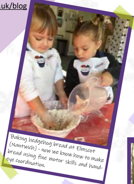
Baking hedgehog bread at Elmscot (Nantwich) - now we know how to make bread using fine motor skills and hand-eye coordination.