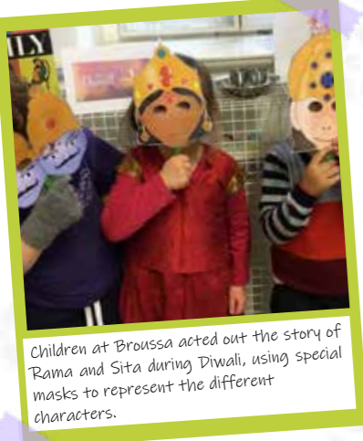
Children at Broussa acted out the story of Rama and Sita during Diwali, using special masks to represent the different characters.