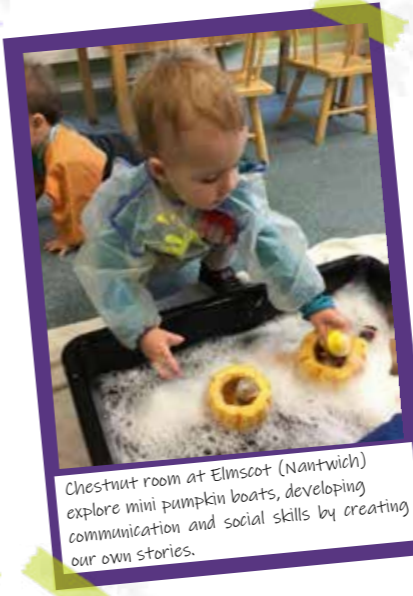
Chestnut room at Elmscot (Nantwich) explore mini pumpkin boats, developing communication and social skills by creating our own stories.