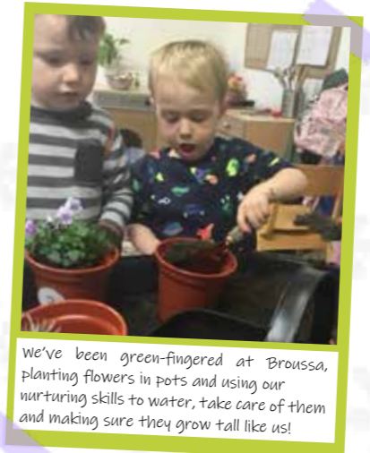
We've been green-fingered at Broussa, planting flowers in pots and using our nurturing skills to water, take care of them and making sure they grow tall like us!