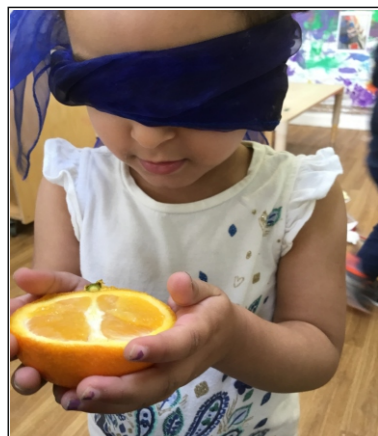
Ayah from Woodlands Owls engaging in a fruit guessing blindfold game.