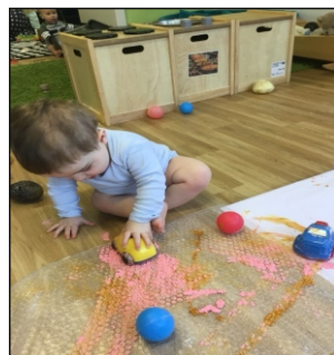
Joe at Broussa explores paint and textures using cars and balls to roll and make marks