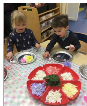
The children at Woodlands have been creating transient art using coloured petals