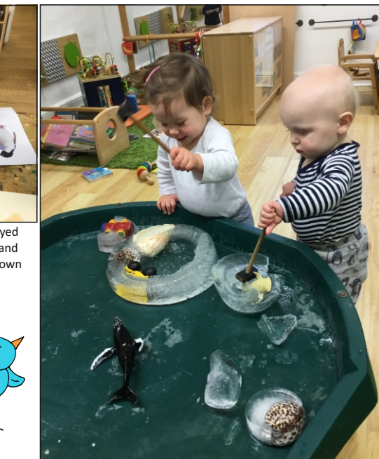
The children in Rabbit at Hale enjoyed ice play, they used the hammers to chip away at the ice to free the sea animals, cars and shells!