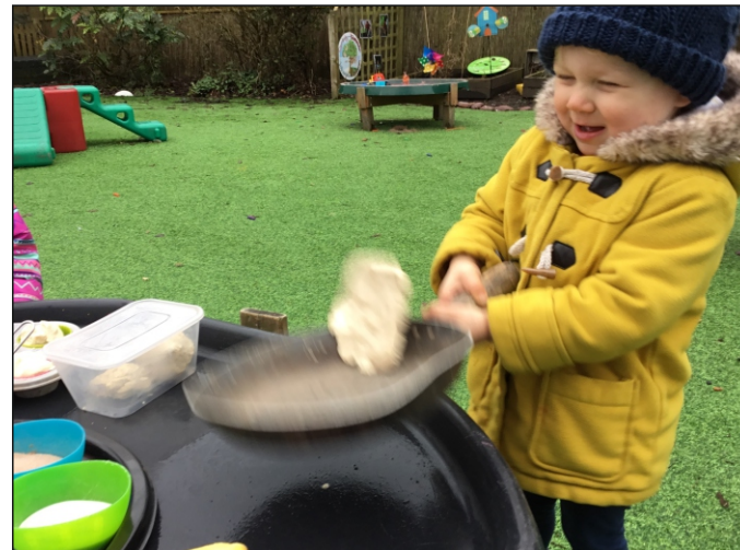
Sophia from Otters at Woodlands having a go at flipping a pancake!