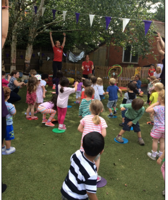
Here the children are enjoying Stetch 'N' Grow Sports Day at Broussa