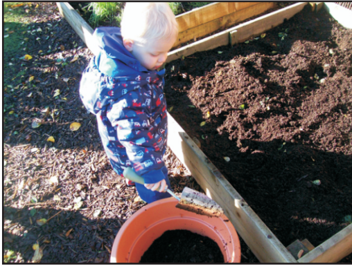
Harrison from the Hedgehogs room at Woodlands has done a great job filling up the planter with soil and helping plant Irises and Crocuses

We post about our activities each week on our Facebook page www.facebook.com/ElmscotGrp