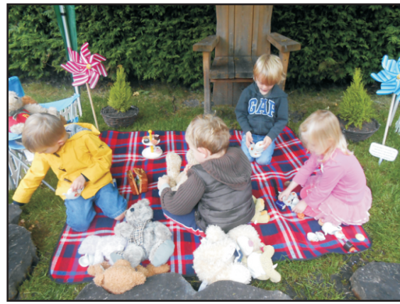
The children from Elmscot's Oak Room join the teddy bears to share a picnic