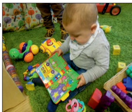
Jayden enjoys the pictures and sounds of a book in the book area at Broussa.