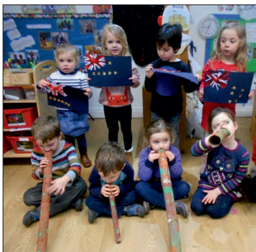
The children from Hale's Owl room made Australian flags and didgeridoos for Australia Day.