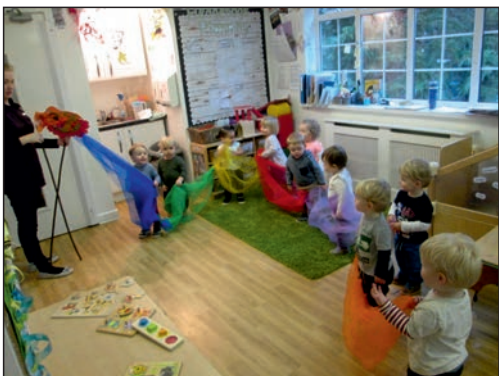
The children in Hedgehogs at Woodlands celebrated Chinese New Year by making their own dragon to dance with.