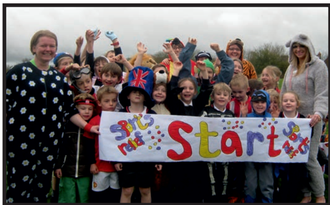
Children from School's Out Bowdon preparing for the Fun Run and getting very excited.

School's Out staff and children carry out many activities to raise money for local and children's charities. Recently the children wanted to raise funds for Sports Relief. They held a cake sale and 'guess the name of the bear' competition. At Bowdon the children also organised a fun run, where they dressed in fancy dress and ran 3 times around the school field. In total they raised over £245.00 for the charity.