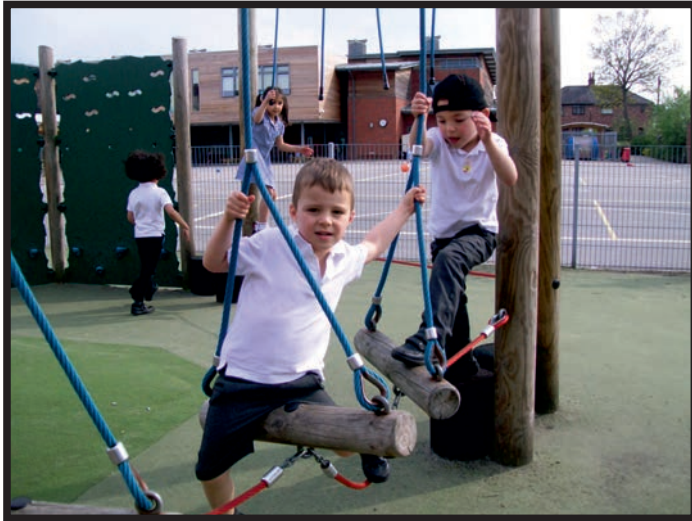
Above: Children at School's Out Navigation enjoying the trim trail.

Right: Children at School's Out Bowdon showing their art work for a recent art competition which was held in Hale. The children all received a certificate for their entries.