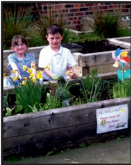
Above: Children at School's Out Navigation had lots of fun planting sweet peas and sunflower seeds.