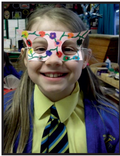
Children at School's Out WellGreen creating their very own Superhero masks as part of their hero's week.