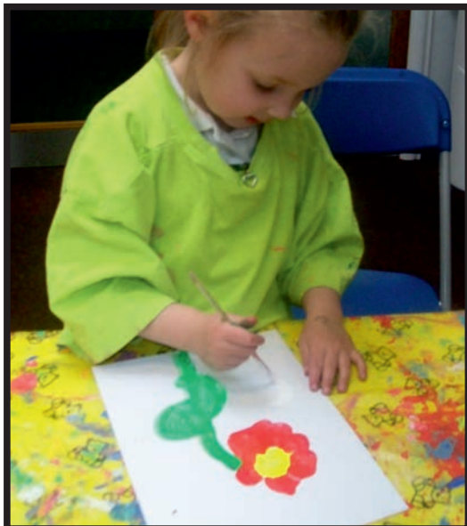
Left and Above: Children at School's Out Cloverlea painting pictures of their favourite things.

School's Out has recently celebrated reaching 500 registered children attending every week across our 8 out-of-school Clubs.