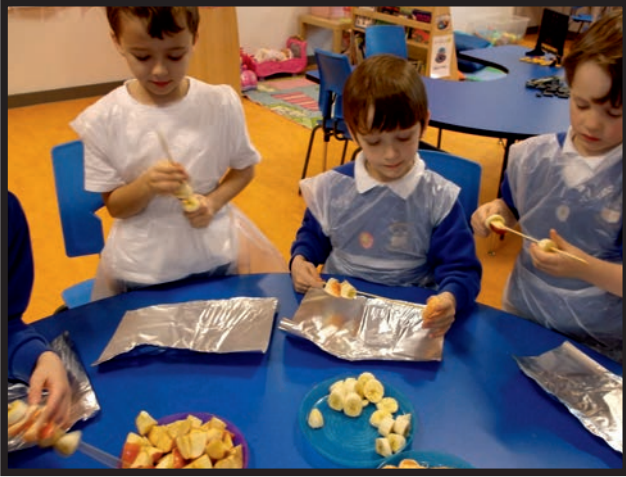
Above: Children at Worthington creating fruit kebabs and learning about healthy eating.