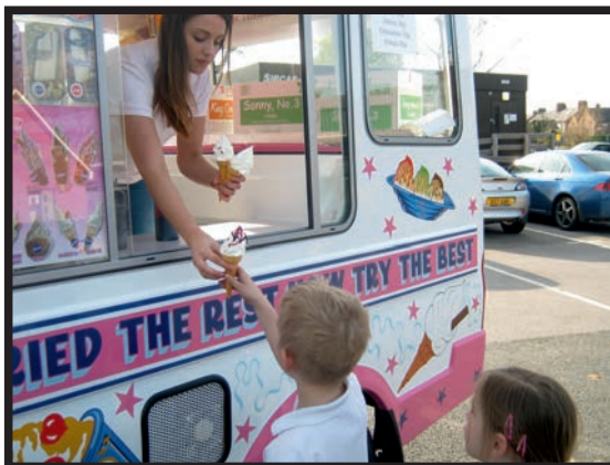
Children at School's Out Bowdon enjoyed the ice cream visit, they even got to choose their favourite toppings.

Over 2000 local children have attended School's Out Clubs since the Clubs first opened 11 years ago. An enormous effort is made to ensure that every child who attends School's Out is safe, happy and enjoys themselves. To celebrate this milestone, School's Out arranged for an ice cream van to visit all clubs and every child enjoyed a free ice cream of their choice.