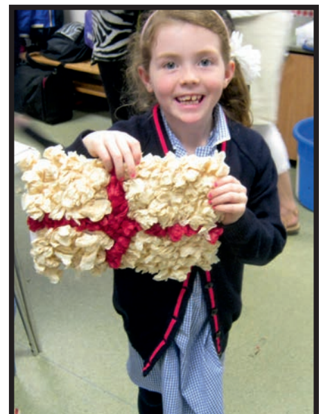
Celebrating St George's Day at School's Out Bowdon by creating their own flags.