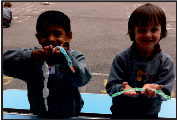
Children at School's Out APS enjoyed a Bug's Week and created their own creatures from model magic.