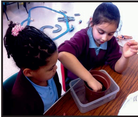
Above: School's Out at Heyes Lane planting their pumpkin seeds, in preparation for the Elmscot Group Pumpkin Challenge. The children are very excited and hoping to win with the heaviest pumpkin.

Below: Children at Bollin School's Out showing how much their pumpkin has grown (We have a Pumpkin Challenge 2014 across the Elmscot Group to see who can grow the largest for Halloween!)