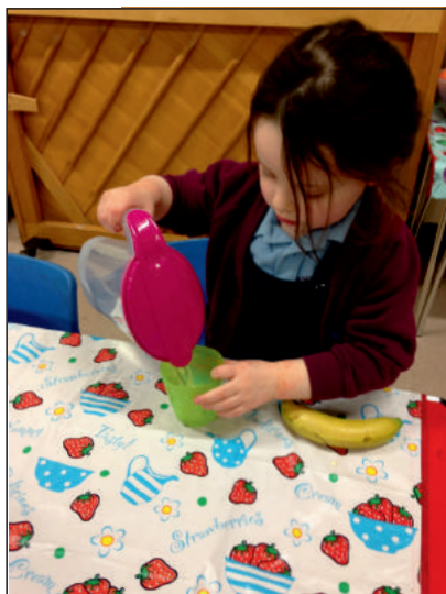
Scarlet at Heyes Lane helps herself to a drink of water at the snack