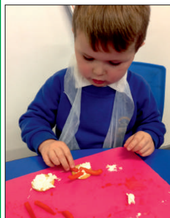
At Worthington children made cracker spiders during Super Hero Week. The children really enjoy food orientated