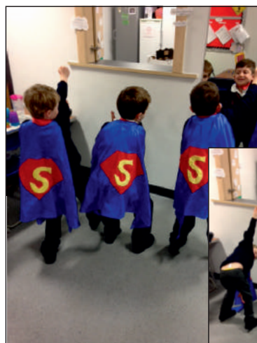
Striking a super hero pose! The newly made capes are being put to good use at

At School's Out, we welcome Ofsted's 'formalisation' of embedding British culture as it is the basis for democracy and a respectful, diverse community. We want to encourage children attending our Clubs to appreciate these issues and grow up understanding their value.