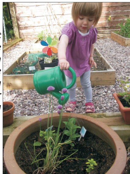
Lilia taking care of the herbs that the Squirrel group (Hale) have been growing