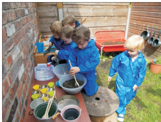
Above: The boys in Oak making a mud birthday cake in Elmscot's new mud kitchen - measuring and pouring is so much fun!